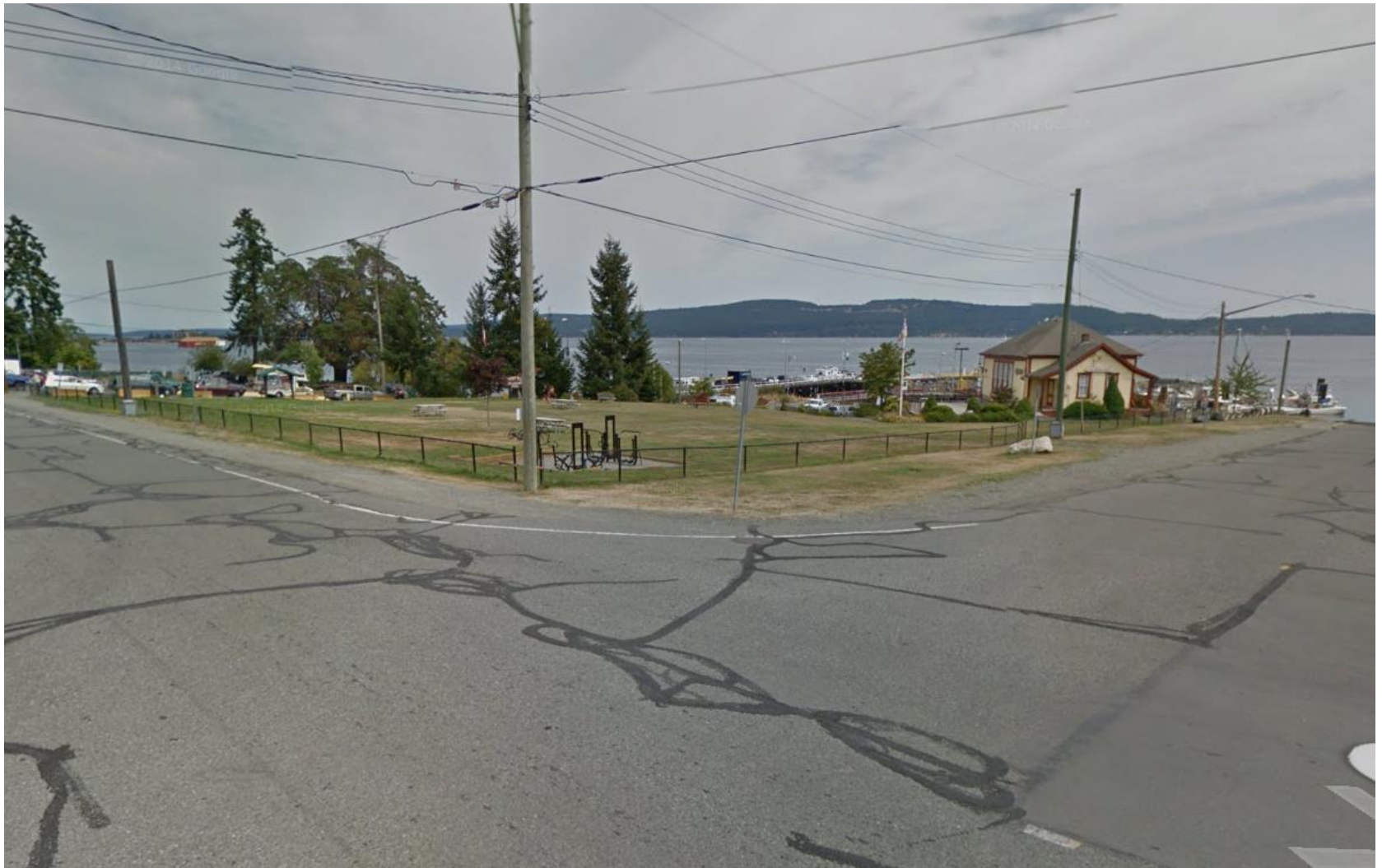
Pre-Construction On Queen Street at Joan Avenue looking North East