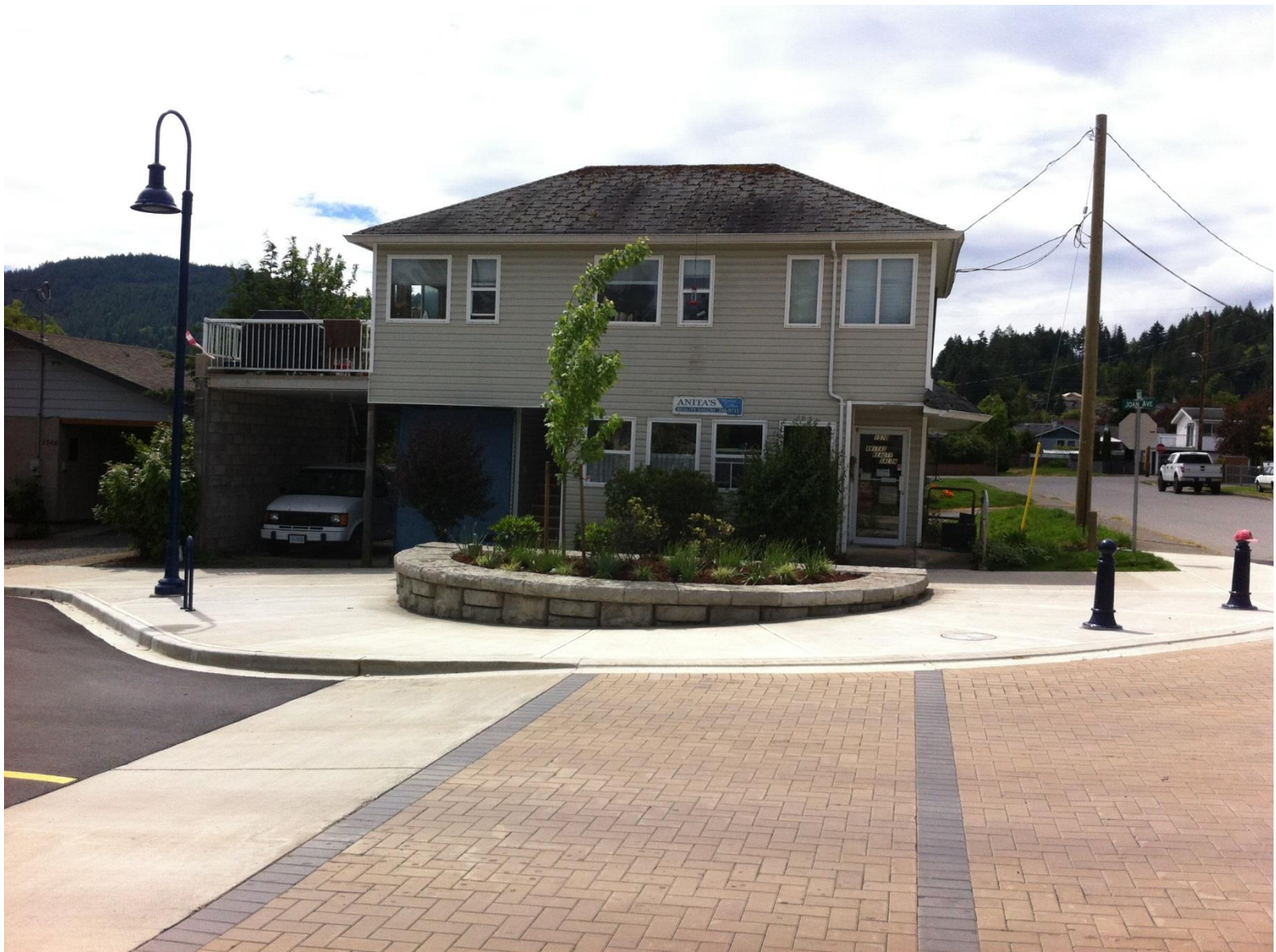
Post-Construction On Joan Avenue at King Street looking South