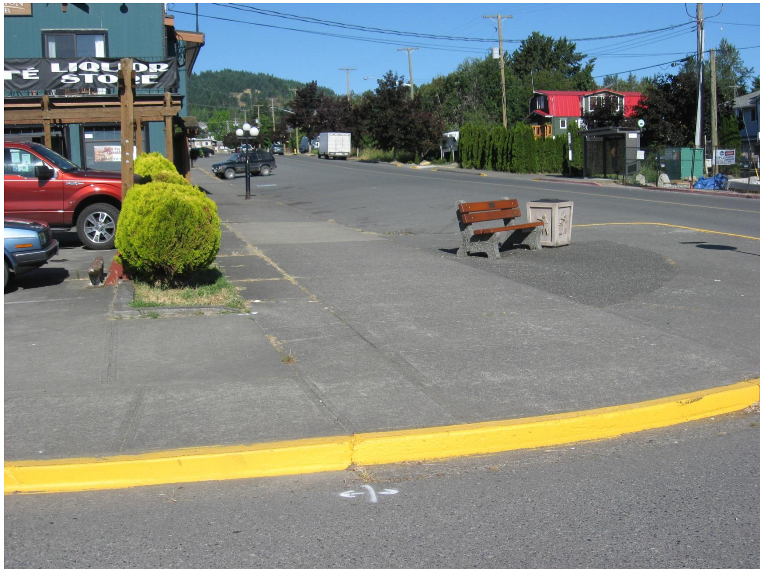
Pre-Construction On Queen Street at Joan Avenue looking West