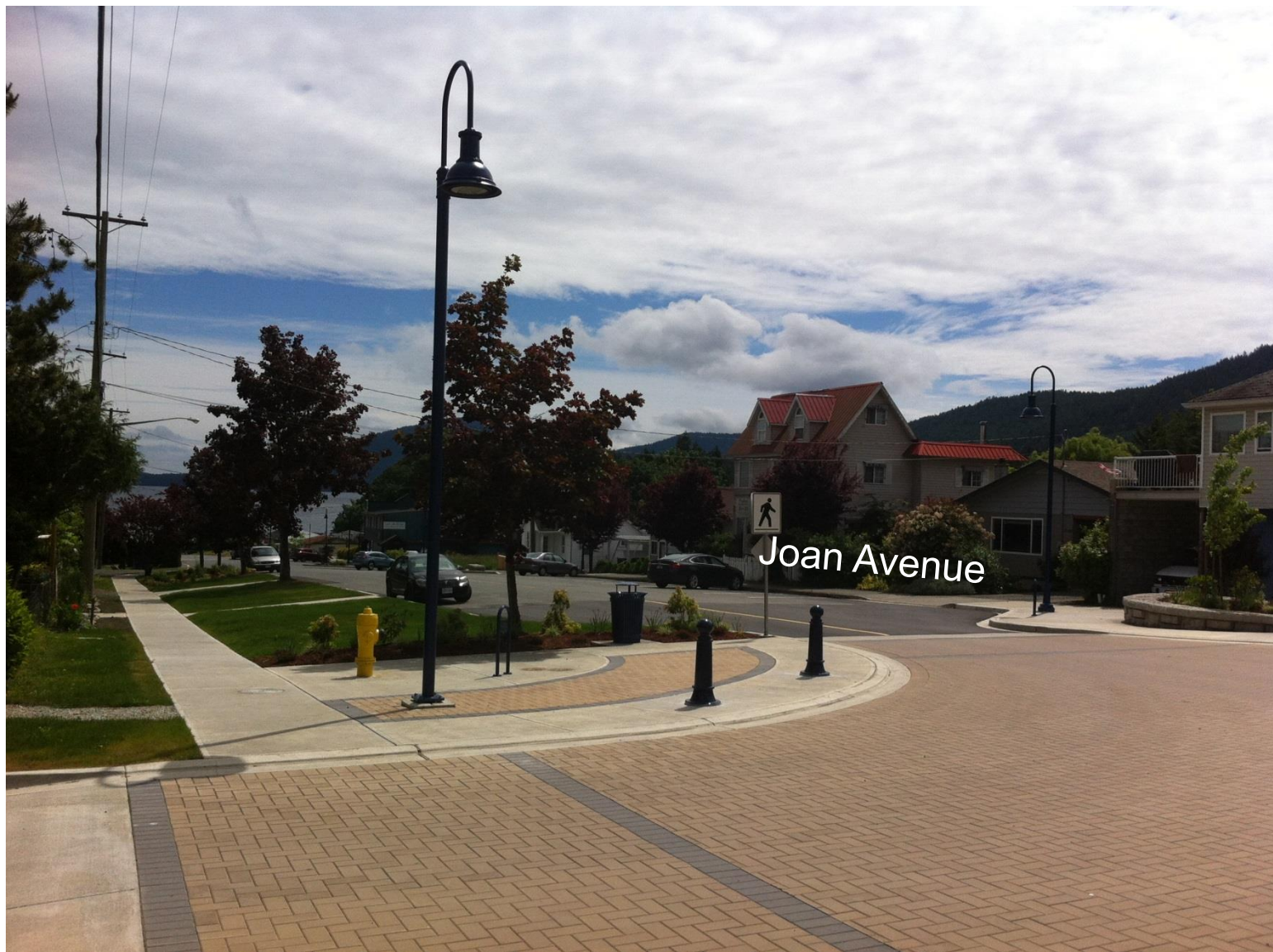
Post-Construction On King Street looking East down Joan Avenue