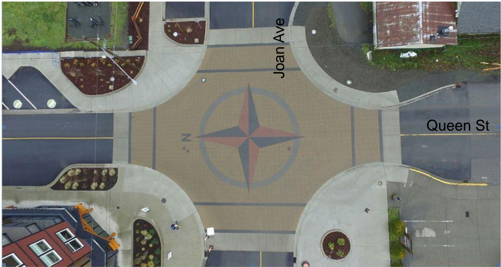
Post-Construction Queen Street at Joan Avenue – East upward Raised intersection and crosswalk