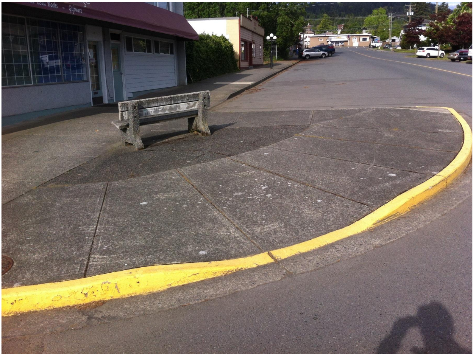
Pre-Construction On King Street looking West down Joan Avenue