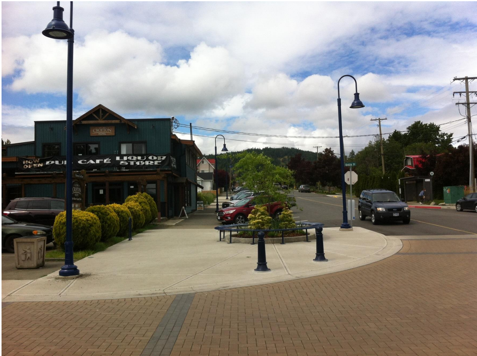
Post-Construction On Queen Street at Joan Avenue looking West