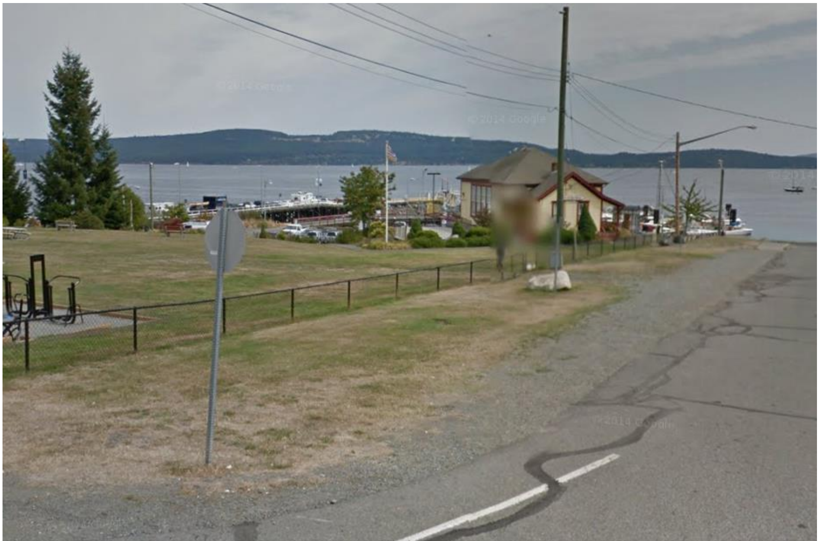
Pre-Construction On Joan Avenue at Queen Street looking North East