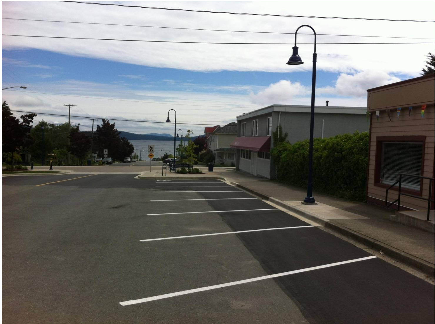
Post-Construction On Joan Avenue at King Street looking East