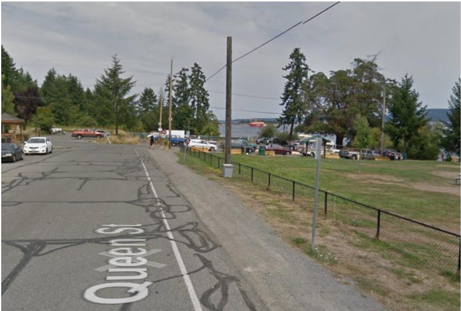
Pre-Construction On Queen Street at Joan Avenue looking North East