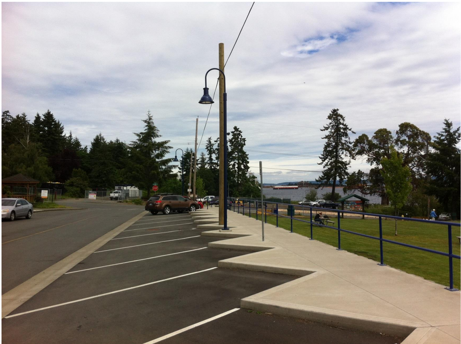
Pre-Construction On Queen Street at Joan Avenue looking North East