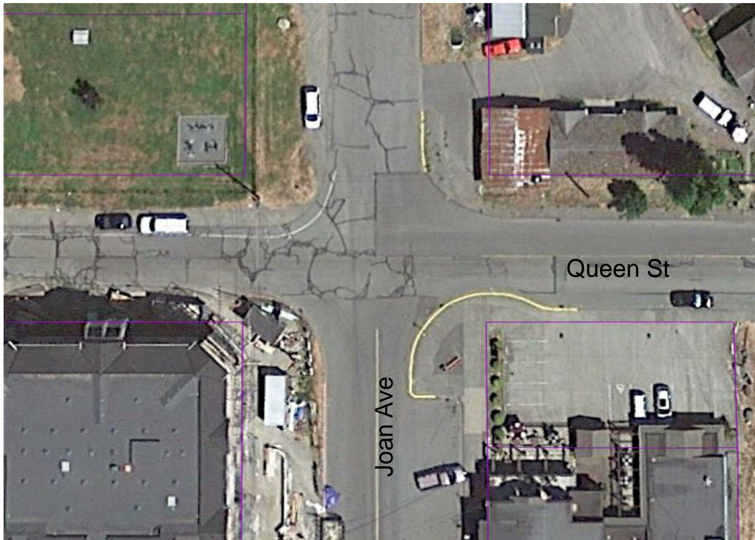
Pre-Construction Queen Street at Joan Avenue – East upward