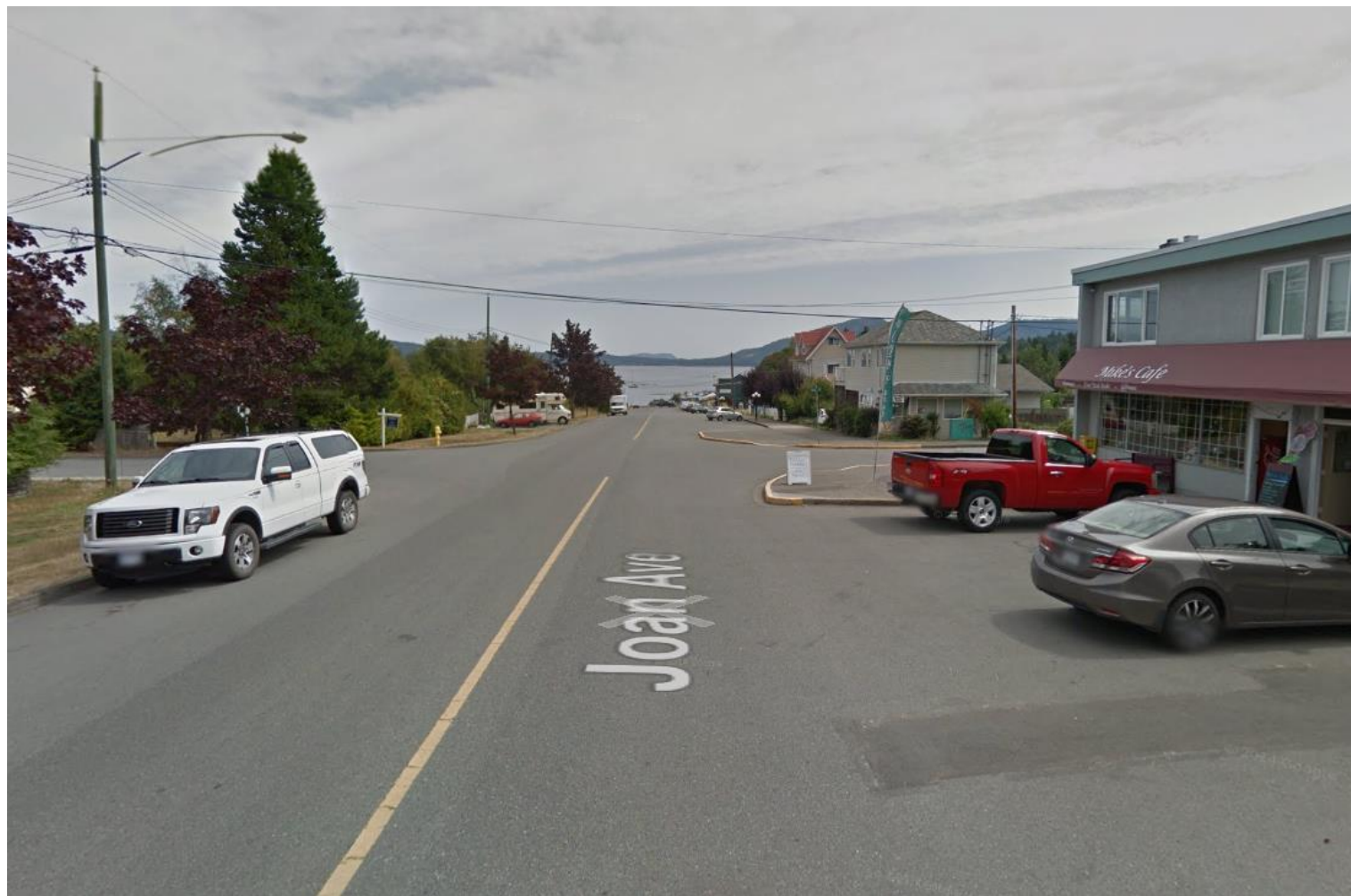
Pre-Construction On Joan Avenue at King Street looking East