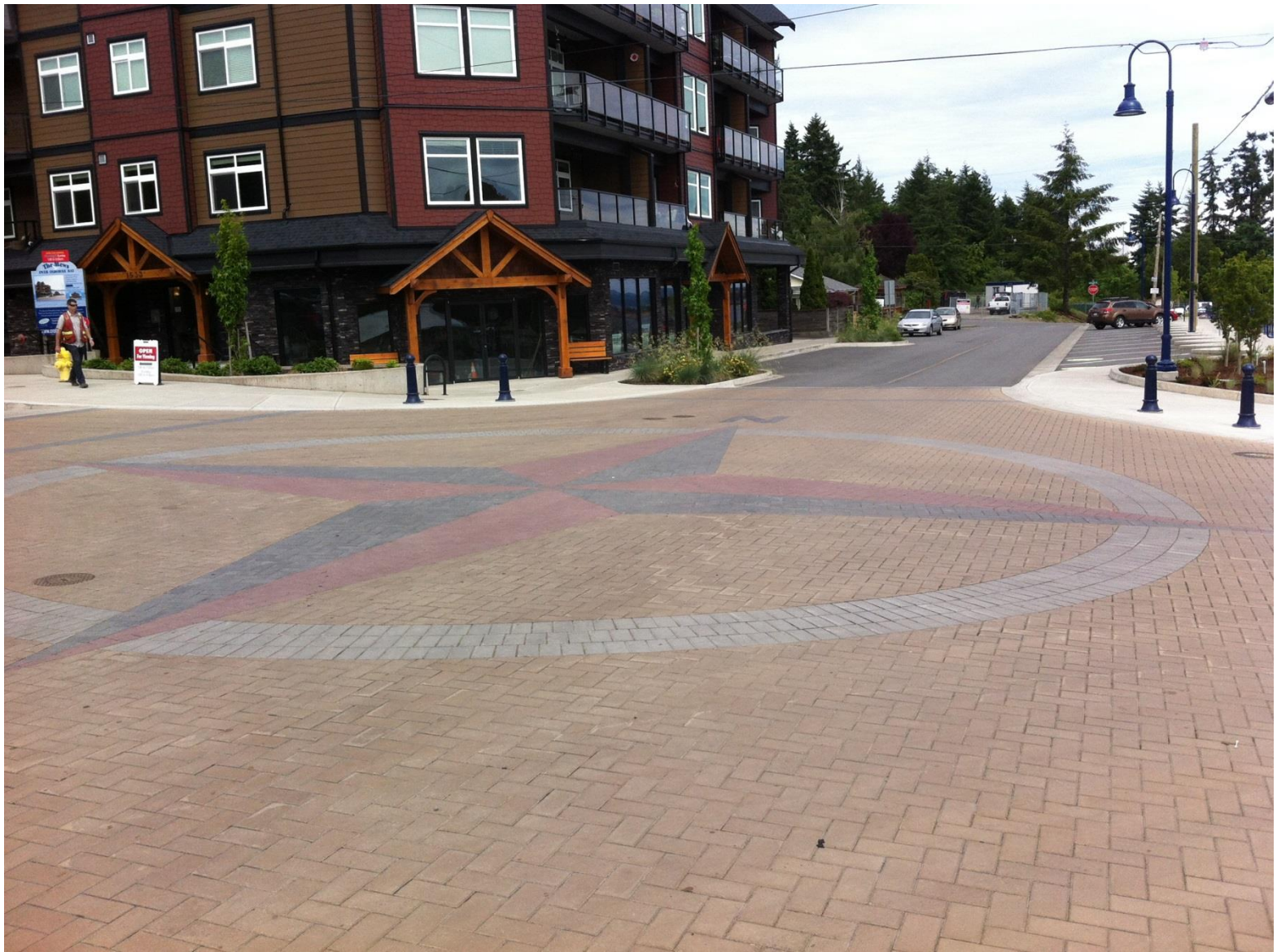
Post-Construction On Queen Street at Joan Avenue looking North