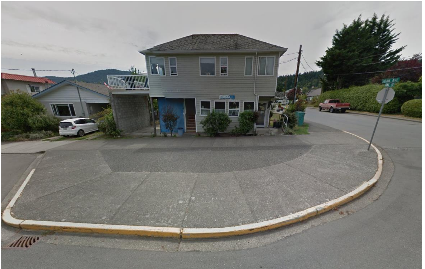
Pre-Construction On Joan Avenue at Queen Street looking South