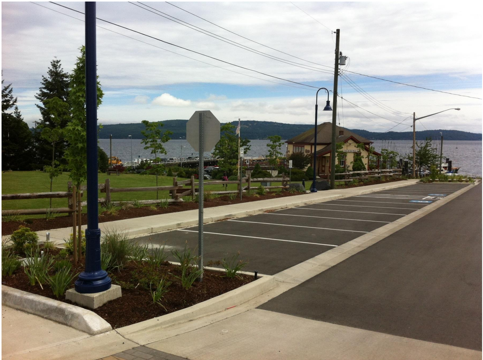
Post-Construction On Joan Avenue at Queen Street looking North East