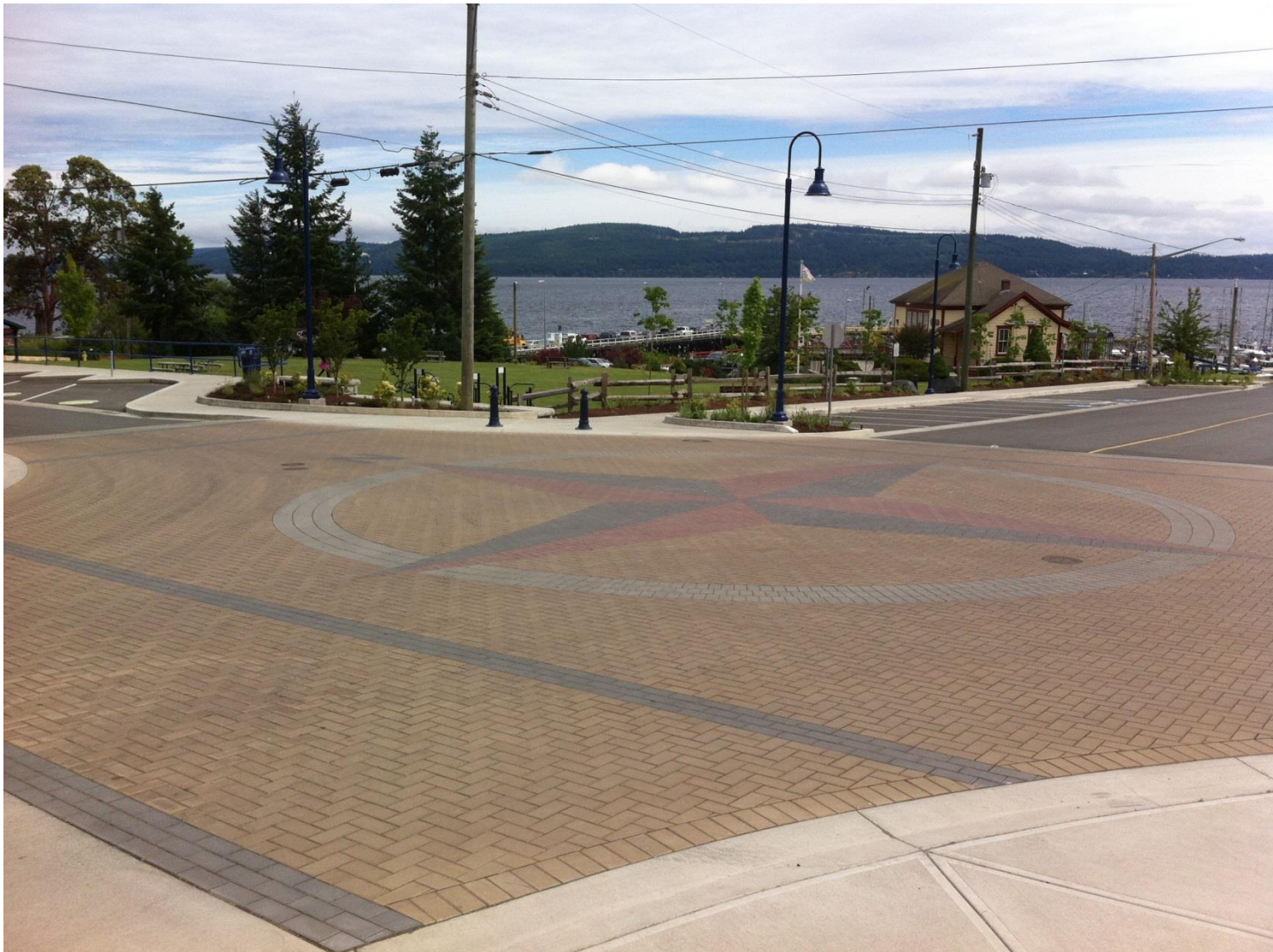
Post-Construction On Queen Street at Joan Avenue looking North-East