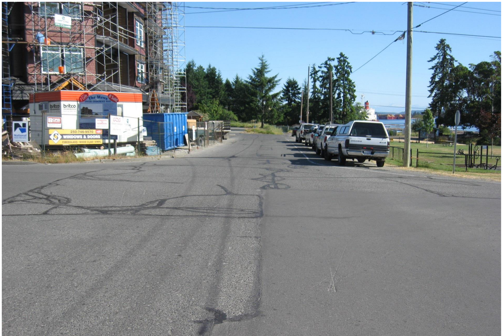
Pre-Construction On Queen Street at Joan Avenue looking North