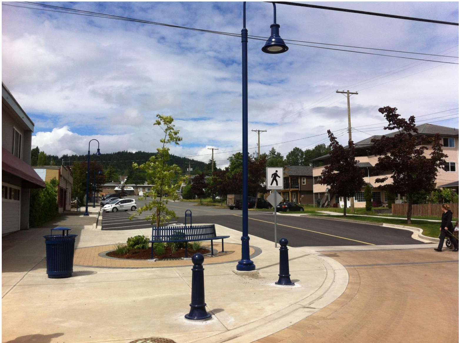
Post-Construction On King Street looking West down Joan Avenue