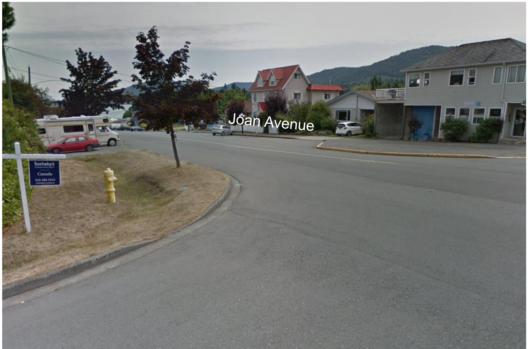
Pre-Construction On King Street looking East down Joan Avenue